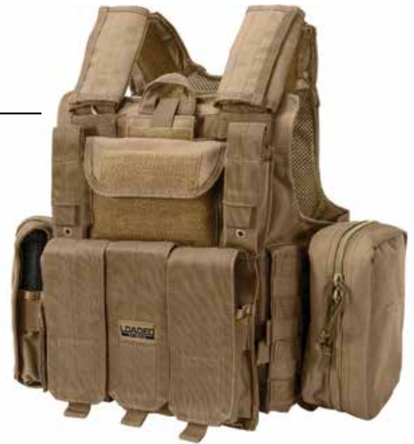
Parts Of The Vest