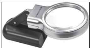
Integrated stand for hands-free use