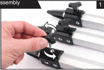
1 Attach (F) tripod leg screw to the extension base on each of the (Q) tripod legs.