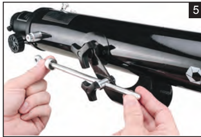
5 Insert the (O) slow motion control rod into the hole on the (J) yolk mount.