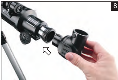
8 Insert the barrel of the (C) diagonal into the focuser tube on the (L) main telescope optical tube and tighten the set screw.