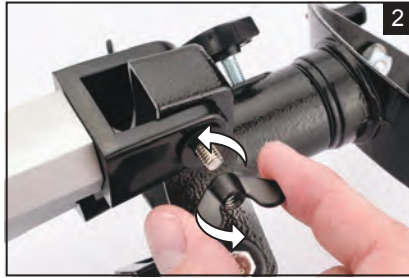
2 Attach each (Q) tripod leg to the (J) yolk mount using the (E) leg to yolk screw sets.