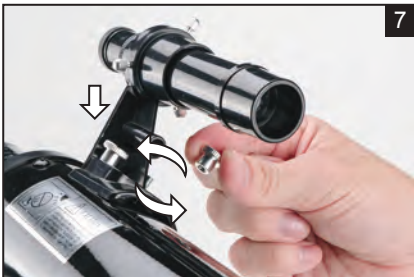
7 Remove the (K) knurled nuts and attach the (I) finderscope to (L) main telescope optical tube with the battery compartment and lens facing the front of the telescope. Secure by tightening the (K) knurled nuts.