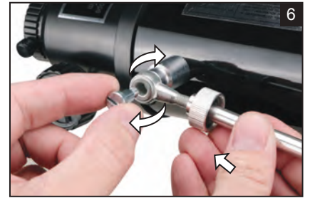
6 Secure the (O) slow motion control rod with the included (P) control rod screw by tightening it with the included (G) screwdriver.