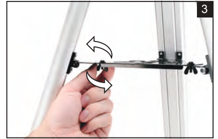
3 Use the (H) three tripod screws on the (N) center leg brace to connect each of the center leg braces to the three (Q) tripod legs.