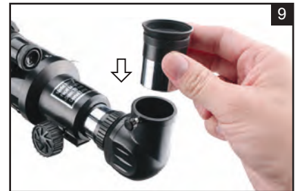
9 Choose one (B) eyepiece and insert the chrome barrel of the eyepiece into the (C) diagonal and tighten the set screw. See reverse side for additional information.