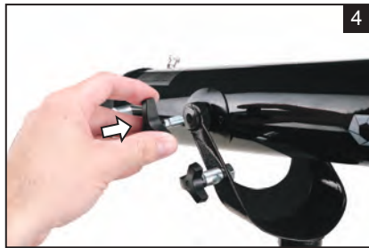
4 Line up the (L) main telescope optical tube with the side mount holes on the (J) yolk mount and secure in place using the two (D) optical tube screws.