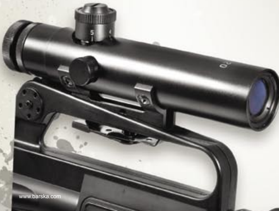
4x20 M16 AC10838